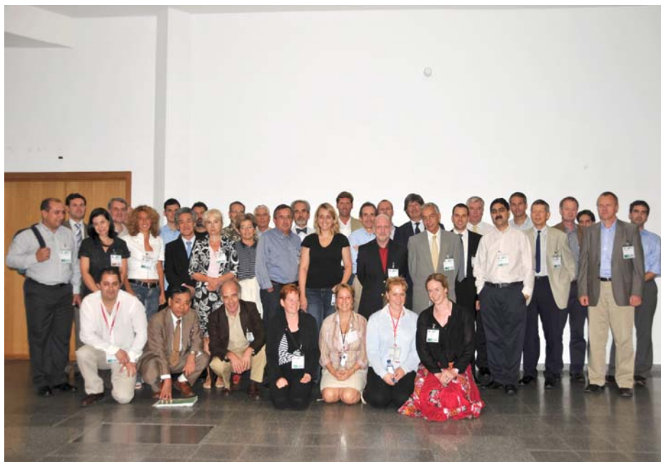
National Coordinator's Meeting Lisbon 2008